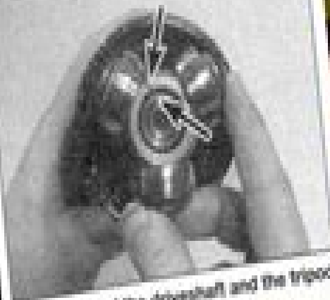
3.5b .... and the driveshaft and the tripod joint