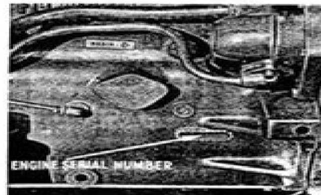
Illustr. "B1" - Location of engine serial number