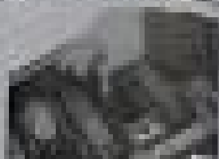
Figure 1.1: An early piano, showing its wooden case and keyboard.