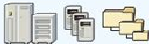
Databases, servers and directories