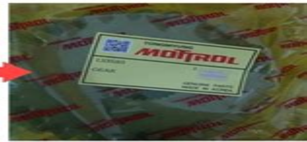
[ Actual Photo - Real Packing ]