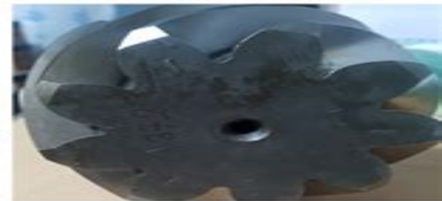
[ 100% Real Photo ]