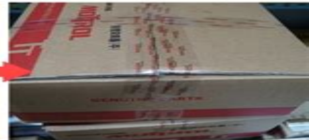
[ Actual Photo - Real Packing ]