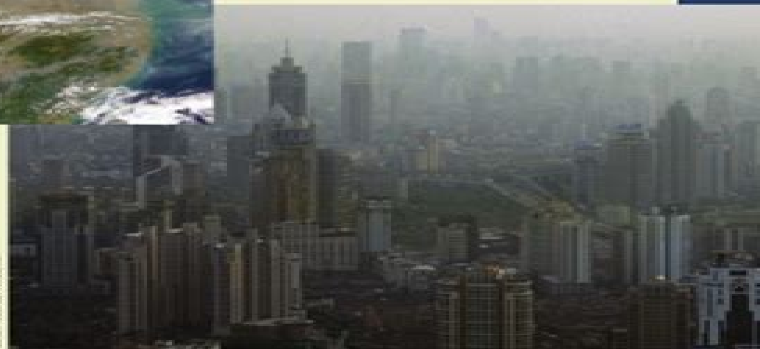
Shanghai, China, is one of a number of Asia's large cities that have been polluted and darkened by the regional haze from the cocktail of pollutants in the South Asian Brown Clouds.