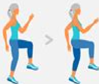
2 High knees running to place