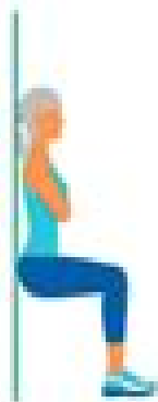
4 Wall sit