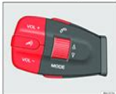
Fig. 2 Multi-function control buttons.

The mobile phone system can be controlled from the multi-function control or by using the voice control system.