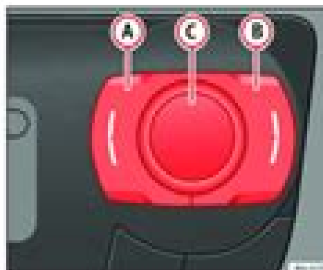
Fig. 3 Radio buttons.