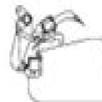
Hydraulic cylinder fully extended

If the hydraulic cylinder is not fully extended, it may increase loading of the scarifier and cause excessive loading of the hydraulic cylinder and scarifier linkage.