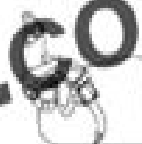
Scarifier bar fully retracted