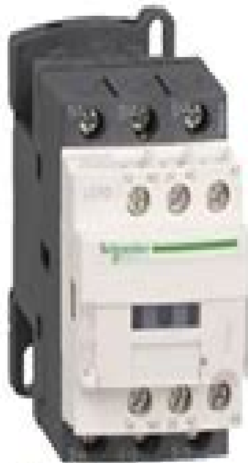
415 VAC 3phase Magnetic Contactor with 230 VAC coil