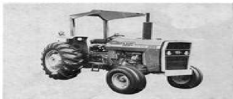
MF 255, MF 265 AND MF 275 TRACTORS