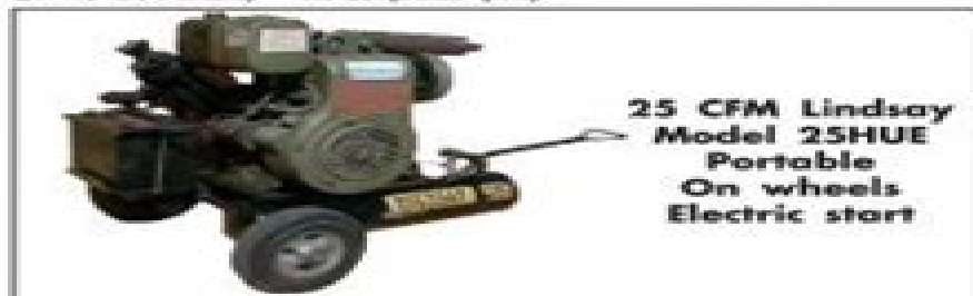
25 CFM Lindsay Model 25HUE Portable On wheels Electric start