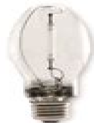
ED17 MEDIUM BASE LU50/MED LU70/MED LU100/MED