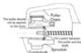
How to fit the puller