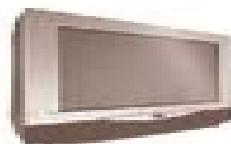
Acorda 90102/90172/90181 25W