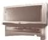
Acorda 90102 25W