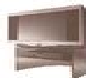
Acorda 90172 25P