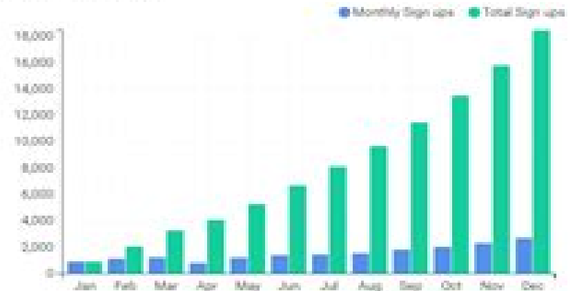
Monthly Sign Ups