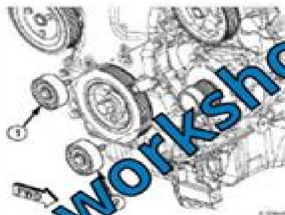
Fig. 67: Removing/Installing Accessory Drive Belt Upper & Lower Idler. Courtesy of CHRYSLER LLC

Remove right engine mount bracket retaining bolts (4). Remove retaining nuts (2) and reposition mount bracket (1).