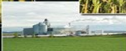
Ethanol Processing Plant