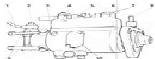
Fig. L3—On models equipped with C.A.V.-D.P.A. pump, loosen bleed screws 2, 3 and 4 in that order to bleed air from pump. Refer to text.