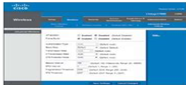
Wireless > Advanced Wireless Settings

The Advanced Wireless Settings screen is used to set up the Router's advanced wireless functions. These settings should only be adjusted by an advanced user because incorrect settings can reduce wireless performance. In most cases, keep the default settings.