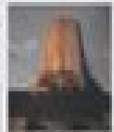
Devil's Tower, Wyoming, USA

Read the passage below about igneous rocks and fill in the gaps using the words in the box.