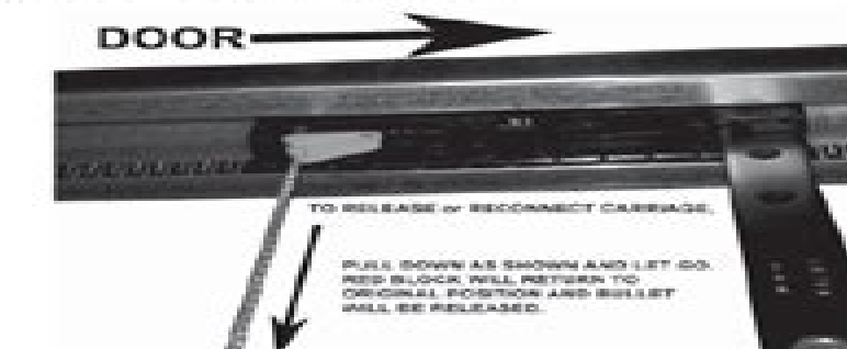
FIG. 6-3 Carriage Release

TO RECONNECT CARRIAGE: 1. Verify RED block is in the UP position. 2. Manually move door until carriage engages bullet. 3. Raise or lower door using remote or wall console.