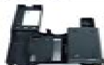
Upper Deck-Center. 1P