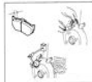
Fig. 20.42 Rear Brake