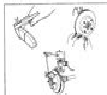
Fig. 20.41 Front Brake

Be sure to torque caliper pin bolts to specification.