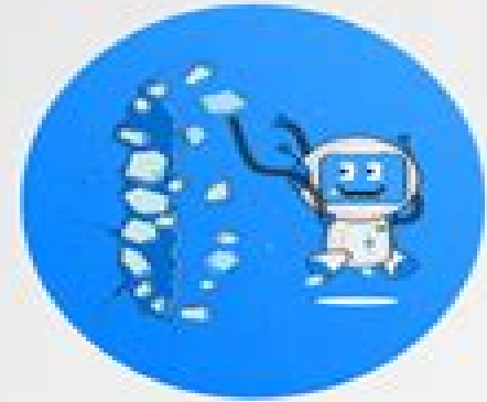
Breaking Language Barriers