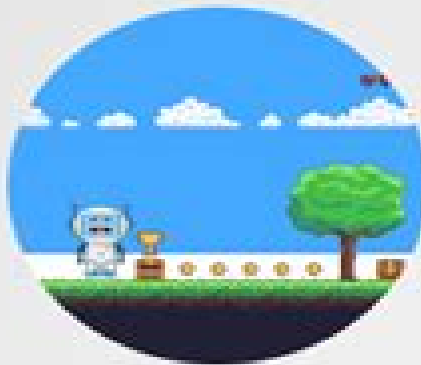
Gamification in Language Learning