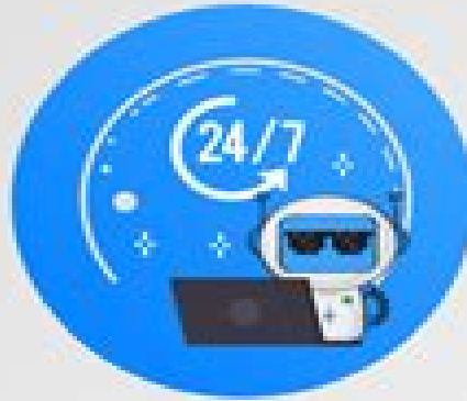
24/7 Availability and Instant Feedback