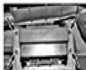
11.47 Undo the four bolts (previously securing the head) from the mounting bracket in the block