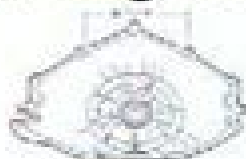
GM Powerglide Aluminum