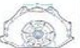
GM TH-225 General