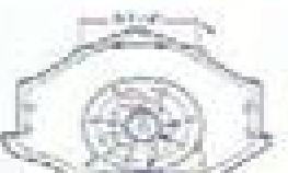
GM TH-400, 350, 250-48, 700R4, 3.80, 4.10, 4.60 Chevrolet