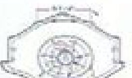
GM TH-400, 350, 250-48, 700R4, 3.80, 4.10, 4.60 Chevrolet