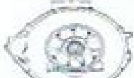
Ford C4, 302, 352, 360, 390, 400, 471, 478