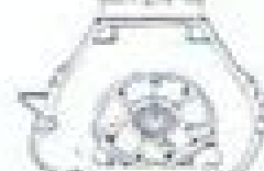
Ford 1A, 429, 460, 251-6, 420R