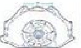
GM TH-225 General