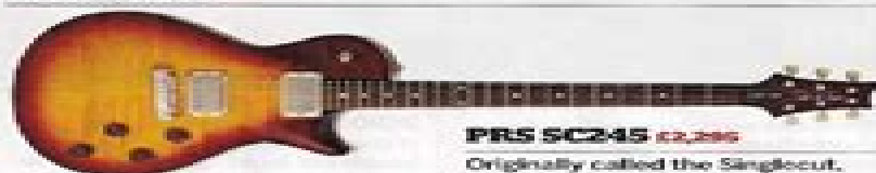
PRS SC245 £2,295

Originally called the Singlecut, it split into two models: the modern rock SC250 and the more vintage LP-like SC245, which uses a smaller 622mm (24.5-inch) scale length with a chambered mahogany body and figured maple top. It is powered by the 245 humbuckers and options include bird inlays.