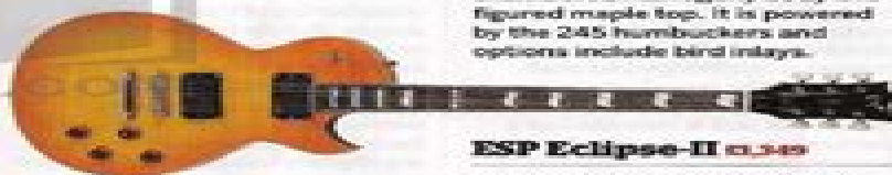
ESP Eclipse-II £1,349

Originally called the Singlecut, it split into two models: the modern rock SC250 and the more vintage LP-like SC245, which uses a smaller 622mm (24.5-inch) scale length with a chambered mahogany body and figured maple top. It is powered by the 245 humbuckers and options include bird inlays.