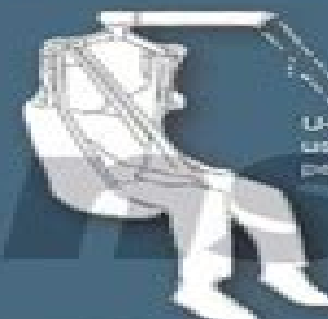
U-sling being used by a person