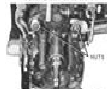
Figure 3-3. Carburetor Attaching Nuts