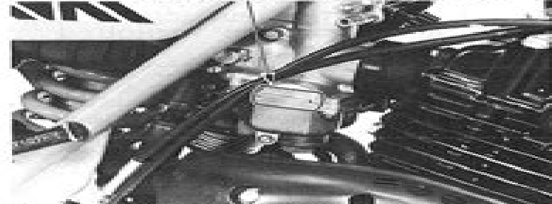
CARBURETOR IDENTIFICATION NUMBER

The carburetor identification number is on the right side of the carburetor body.