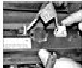
10.5c Lower over the cables and disconnect the wiring after.

10. Remove the cable and undo the bolt each