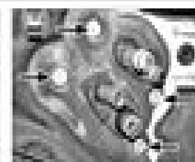
10.5h Undo the bolts (arrowed) then remove the heating pipe and rubber.