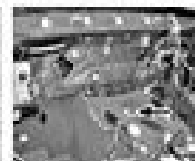
10.5o Compressor then provided (arrowed) at the driver's side.