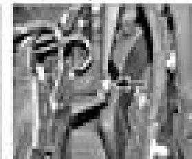
10.5n 4-bolt in the right-hand side of the heater housing (arrowed).

a. Tighten all clamps to their specified torque (see notes).