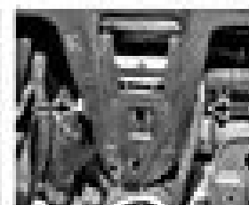
10.5k Undo the bolts (arrowed) and note the heater hose from the pipe.