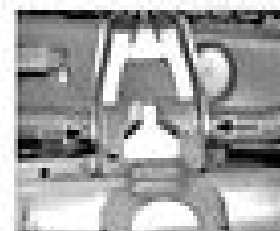
10.5g 4-bolt (arrowed) above the compressor at the driver's side.