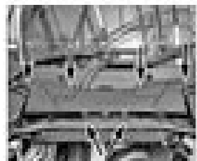
10.6 Unbolt the bolts (arrowed) and remove the pollen filter cover.

4. The airflow, which can be directed by the driver, then flows through the various ducts, according to the settings of the controls. Note