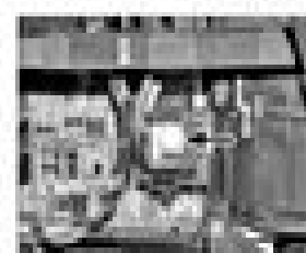
10.5e 4-bolt (arrowed) inside the fan cover.

connections. The complete remove the heater unit and cable (see illustration).