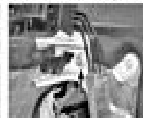
10.5j 4-bolt in the engine compartment above the heating cable hole (arrowed).