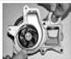
10.5b Remove the pump and the 4-way tap.

5. A new control unit has been fitted. It must be programmed using a dealer test equipment. Connect the bus to a 100V power or suitable equivalent circuit.