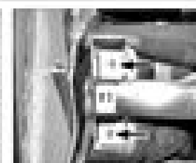
10.5l The fan cover observation is removed by 2 bolts at each end (arrowed).