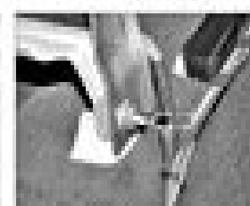
10.5i 4-bolt (arrowed) at the front fan cover.

with the help of an assistant, manoeuvre the fan cover under the passenger side (see illustration). Undo the fan cover observation has a lot of play edges - it must be pushed to seat properly.