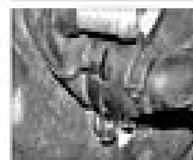
10.5d Undo the bolts (arrowed) and pull the heater hose from the pipe.