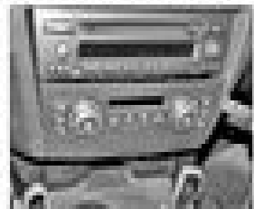
10.5a Carefully undo the control unit from the face.

4. Refitting is a reversal of removal. Note that