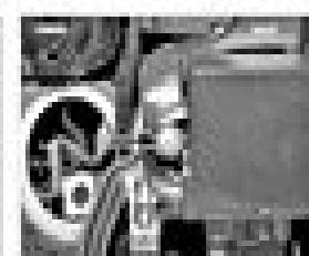
10.5m 4-bolt (arrowed) above the heater assembly.

passenger side. Note the compressor then provided in the fan (see illustration).