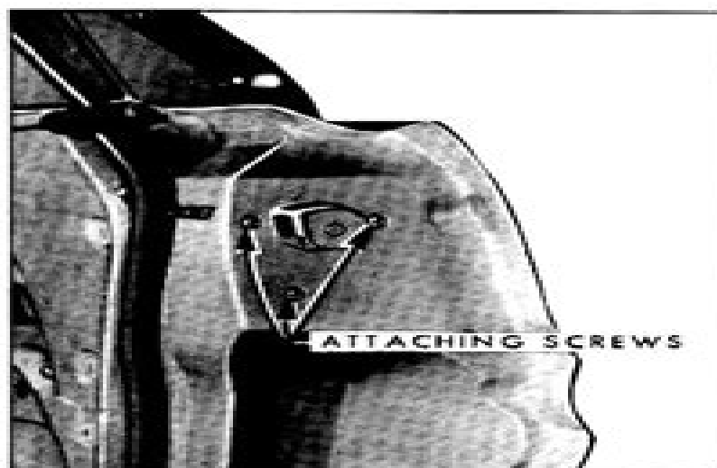
Figure 2-40—Rear Door Lock Assembly

marks on pillar and install striker plate attaching screws.