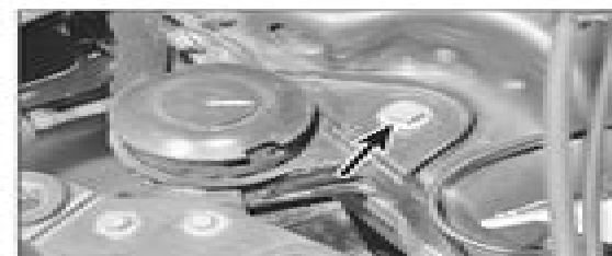
20.22 Left-hand engine mounting body bracket bolt

the transmission using a trolley jack and piece of wood.