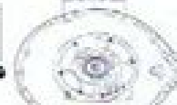
Chrysler TH-727, 341, 383, 400, 474, 440