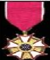
Legion of Merit