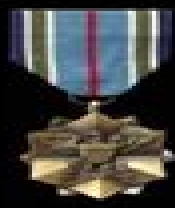
Achievement Medal Joint Service