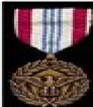
Defense Meritorious Service Medal