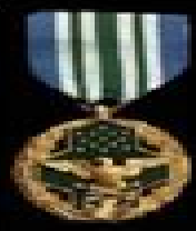
Commendation Medal Joint Service