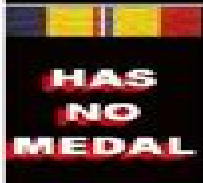
Combat Action Ribbon