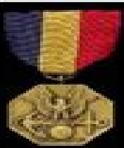
Navy and Marine Corps Medal