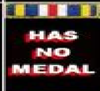
Joint Meritorious Unit Award