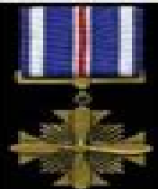
Distinguished Flying Cross