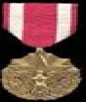
Meritorious Service Medal