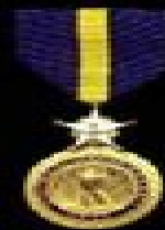
Navy Distinguished Service Medal