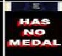
Navy "E" Ribbon