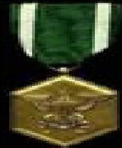
Commendation Medal Navy