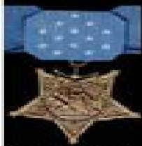
Medal of Honor Navy, Marine, Coast Guard