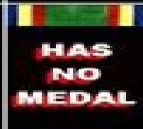
Navy Unit Commendation