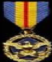
Defense Distinguished Service Medal