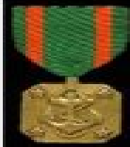
Achievement Medal Navy