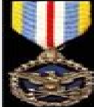
Defense Superior Service Medal