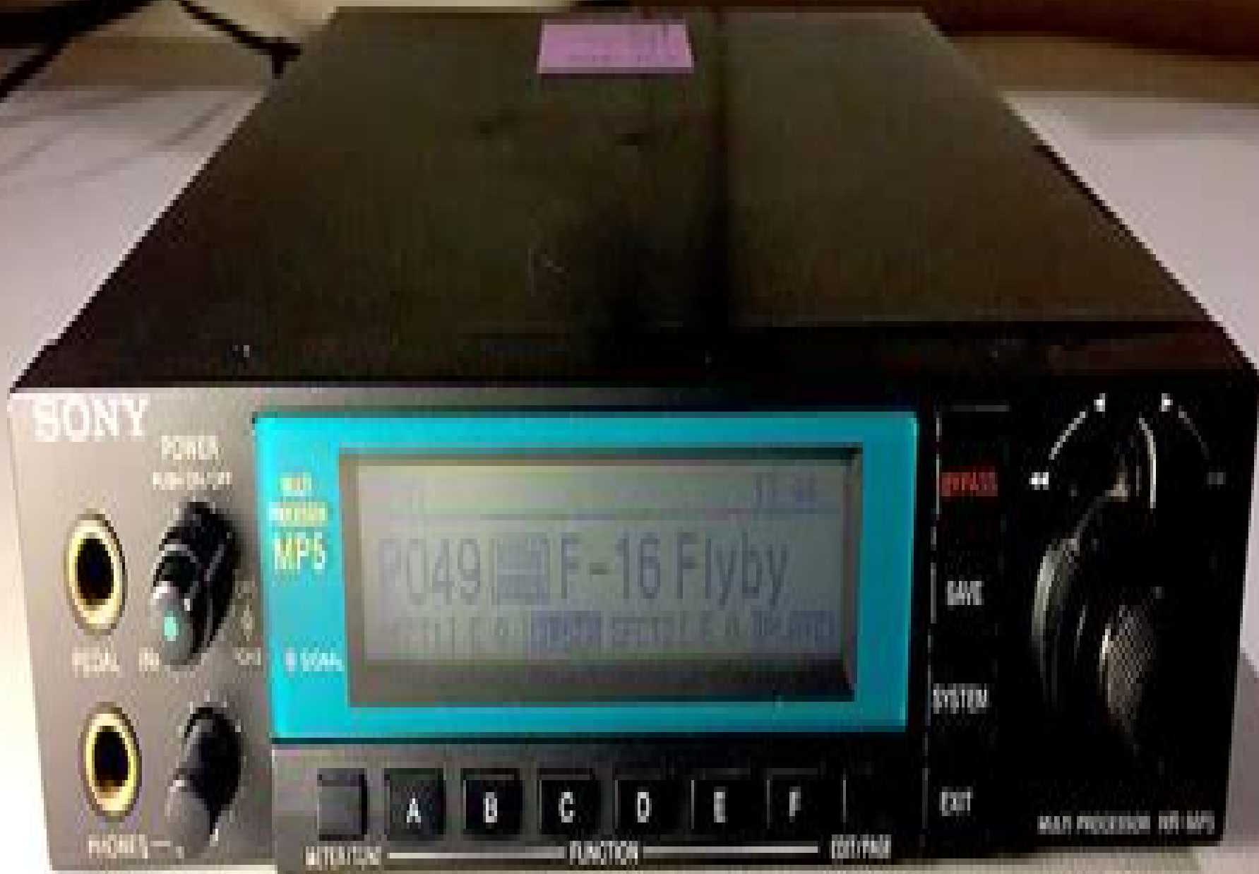
Figure 1: Sony car stereo unit showing the display screen.