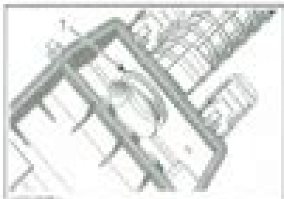
1. Align LOCTITE 590 (202-600 041) intake elbow gap with housing not

If the intake elbow is removed, reseat it with LOCTITE 590 (only 202-600 041) and align its recess with the notch on air filter housing.