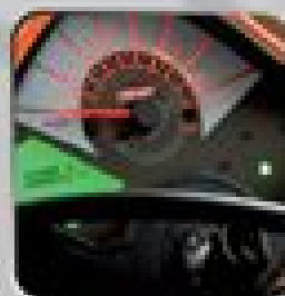
Tablero analógico digital