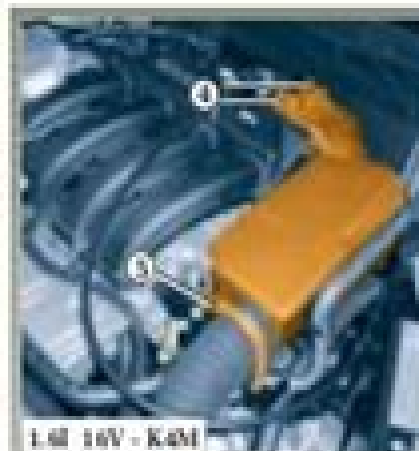
1.0 1.0V - K4M

Retire a tampa 2; substitua o elemento filtrante e reponha a tampa.