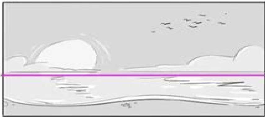
low horizon line