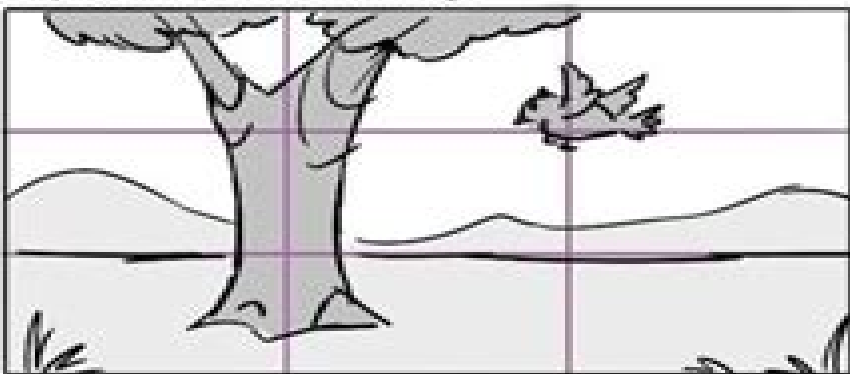
Avoiding the middle