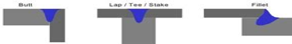
Figure G. Most common weld joints, most other types are variations on these.

As laser welding is a non-contact process there are a broad number of joint geometries that can be welded. In addition the laser is able to weld into areas with limited access. The main joint designs are shown in Figure N. Ideally in any weld joint the thinner material is the top sheet.