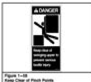
Figure 1-58 Keep Clear of Peak Points

The swing brake pedal is used to stop rotation of the upper over the carrier. To apply the swing brake, push down on the swing brake foot pedal. To release the swing brake, release the swing brake foot pedal.