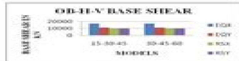
Graph 3.2: Multi OB-H-V Base shear in kN