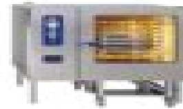
Genius T 12-21