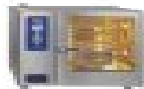
Genius T 10-11