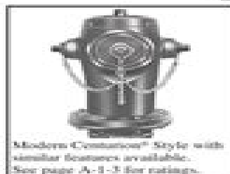
Modern Centurion® Style with similar features available. See page A-1-3 for ratings.