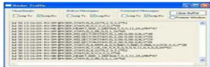
View Traffic window