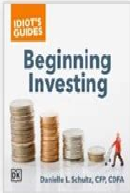
Idiot's Guides Beginning Investing