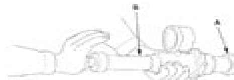
Fig. 3: Applying Pressure On Pressure Tester Attached To Radiator Cap Seal